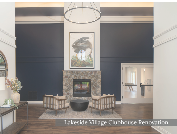
Lakeside Village Clubhouse Renovation