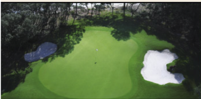
Victoria Park (above) | SouthWood (right)