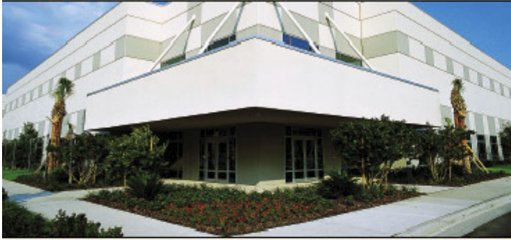
Commercial Real Estate Opportunities