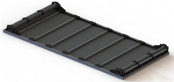
The CoolPV heat exchanger installed on a Solar World PV module

We have selected SolarWorld as our initial PV launch partner and supplier.