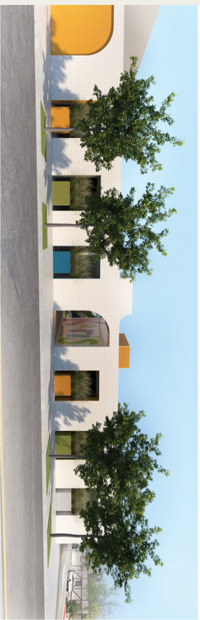
MAGNOLIA BLVD PERSPECTIVE

Strategically located at 4201 Magnolia Blvd in the beloved and popular Magnolia Business District in Burbank, Ca, this proposed facility will be the third daycare under the Karis Family Daycare umbrella and will be a newly built, fully equipped, infant and toddler center serving children ages 2 months-3 years with a capacity of 40 children. The design of the building emphasizes our program's focus on nature and sensory play with a large, lush shaded outdoor spaces complete with safe interactive features and a variety of soft play surfaces, while modular buildings allow us more control over construction costs and timelines.