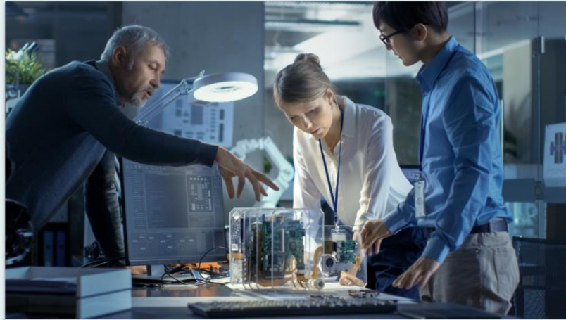
MedFire - Creating a Culture of Innovation

Invest with impact. Invest in MedFire, and let's make a difference together.