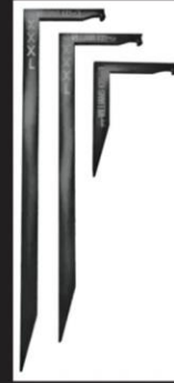
The Williams Key

The Williams Key is an emergency (passive entry) device used by First Responders to gain quick access into buildings and houses. The purpose of the device is to toggle the strike of a lock without doing damage to the lock, door, or frame. It works well on gates with anti-vandal plates, elevator control rooms, commercial utility doors and many other outward swinging metal and wood doors. This device was developed in response to the need by first responders to gain access to locked areas, without having to damage or destroy property in the process of gaining emergency access.