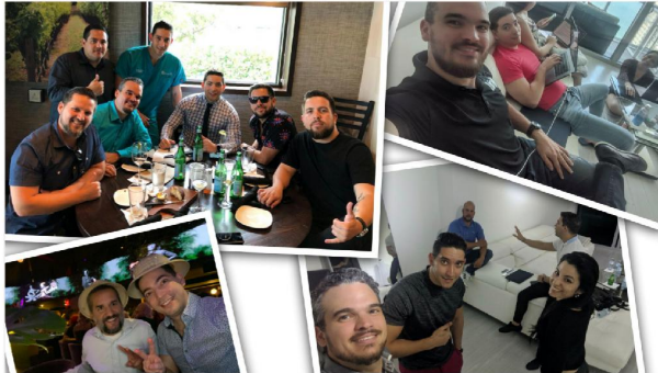
The Linkio team, investors, and friends.

We knew that Linkio was an awesome idea, but what about everyone else? The answer: they loved it! Seven months after creating the company, we asked our friends and families if they would invest in Linkio. We showed them the designs, the idea, the potential, and without even a working beta, we raised over $500,000 in 3 weeks! More than 60 investors from different backgrounds joined forces to help us build and launch the app. I will be forever grateful for their trust and support.