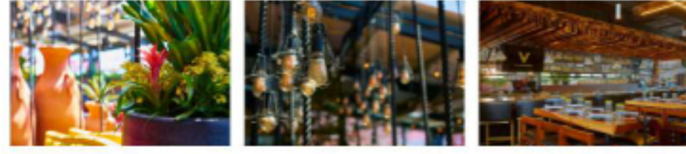
Interior design and decor of Vidorra Deep Ellum

Milkshake Concepts is committed to providing the ultimate dining experience through creating authentic ambiance and food. Vidorra Addison features Mexican cuisine, and the interior of the restaurant reflects the bold, colorful style of Guadalajara. Many of the furnishings, accents, and even dishware are sourced from Mexico to enhance the look and feel.