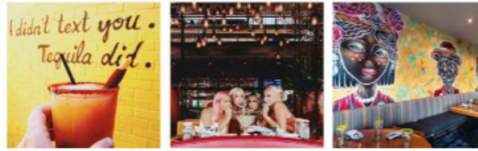
Lively atmosphere of Vidorra Deep Ellum

Equally appealing for date night or a workplace event, Vidorra Addison has a lively atmosphere suited for all types of gatherings. The outdoor patio will be an extension of the indoor space in aesthetics and serves as a relaxing place to have brunch or late night drinks.