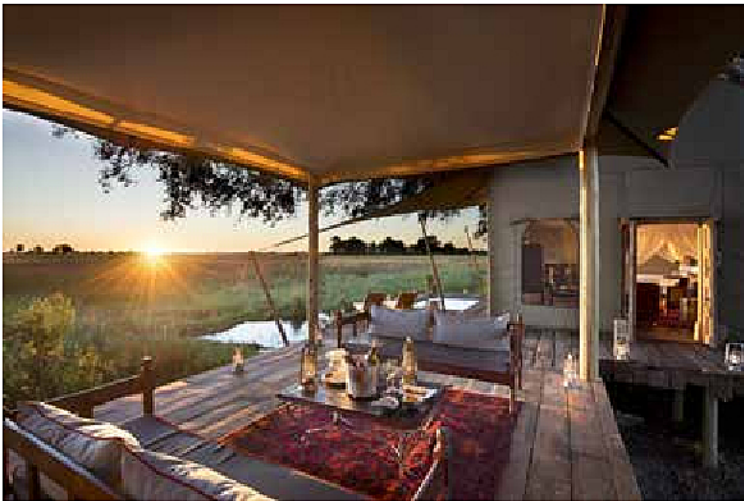
Duba Plains Camp

of deep reds, browns, brass and copper, evoking richness and beauty. Each tent has a full lounge and a gas fireplace. The large bedroom is connected to an open layout bathroom with an impressive copper claw foot bath, indoor shower, separate loo and double basins. Decking around the tent leads to the private plunge pool and outdoor shower, all with views of pristine Botswana wilderness. Under an impressive canopy of African ebony trees, the camp has a sizable main lounge, with adjacent library and dining area. Zarafa has succeeded in successfully retaining a clearly African feel, while balancing that delicate relationship between personal and informal and romance and adventure. With a maximum of just eight guests, Zarafa Camp offers complete flexibility. While drives do focus on the most comfortable and productive times of day, early morning and late afternoon, full day drives, walks and boating (water level dependent) are great ways to fill the day at Zarafa.