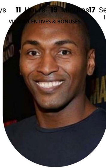
METTA WORLD PEACE