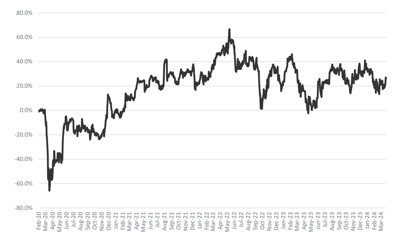
NREF Total Return Performance (Inception through March 31,2024)

NexPoint Real Estate Finance, Inc. (NYSE: NREF) ("NREF" or the "Company") celebrated its third full year as a public company in 2023. Continuing our success, we were able to make numerous accretive investments, while continuing to stay dedicated to our investment thesis of deploying capital in asset classes in which our senior management team has extensive operating experience. For the year 2023, NREF provided investors with an annual dividend of $2.00 per common share, along with a special dividend of $0.74 per common share. Since inception and through March 31, 2024, NREF's total return to common shareholders was 24.8%.