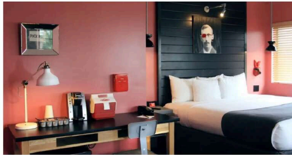
LGBTQ Hotel Gaythering Miami

pricing, A/B testing, algorithm tweaks etc.). We also added a social layer on the LGBTQ friendly hotel service allowing our guests and hosts to connect and discover who will be staying in the same hotel/city to explore the city together. It was a 6 month technical project. Then we kicked off marketing. By the end of Q1, we were growing bookings 20% month over month, until the global pandemic hit.