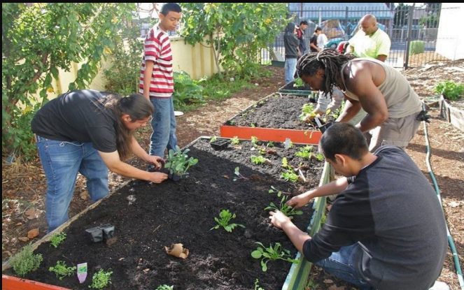
Soil given to Urban Community Farms