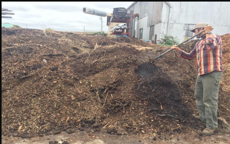
Urban Regenerative Soil Farm