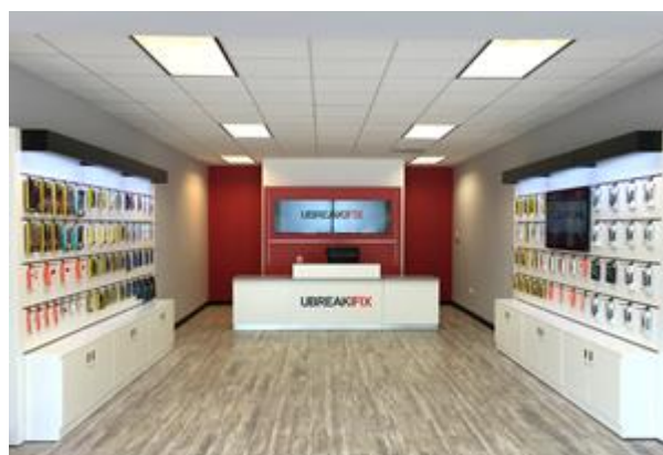
uBreakiFix specializes in same-day repair service of small electronics, repairing cracked screens, software issues, camera issues and other technical problems at its 385 stores across North America.