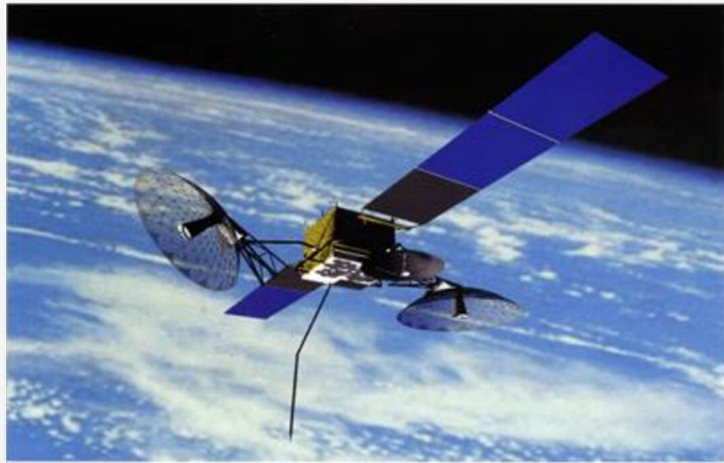
NASA TDRSS Satellite (aging, to be retired)

The only place that Internet in space is on the International Space Station and can only be used by a few people using government-owned satellites (TDRSS).