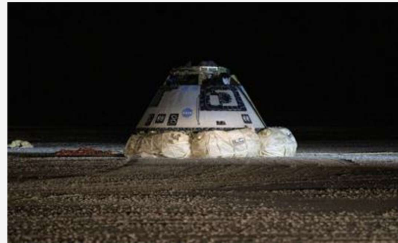
Solstar communication services can ensure mission success.

Solstar is in the prime position to provide these services to NASA