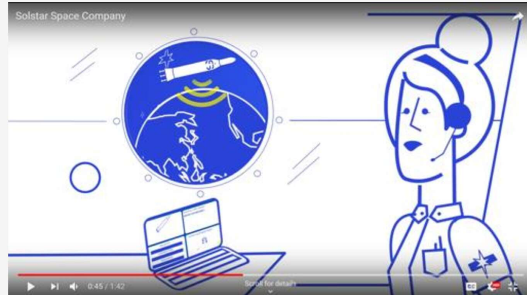
Delivered to your desktop with 24/7 customer care