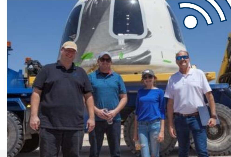
Internet connection from Launch to Landing July 18, 2018