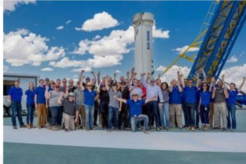
First Commercial WiFi/Tweet in Space April 29, 2018