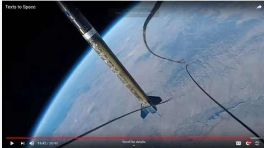
#TextsToSpace November 2013