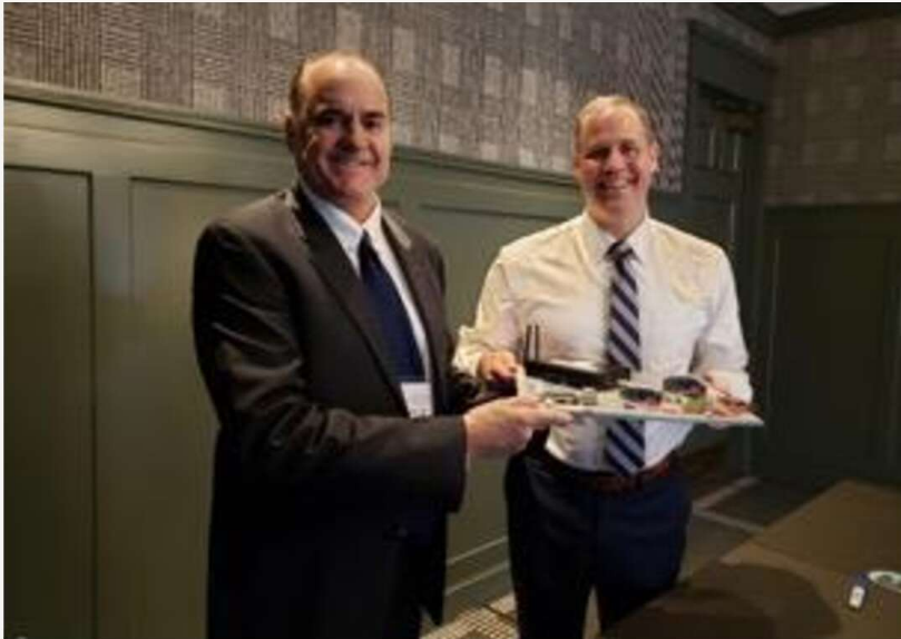
Solstar's Space Routers, WiFi Hotspots and Satellite space communicators

Solstar's high-speed, reliable and easy-to-use space communications platform leveraging the latest commercial satellite networks.