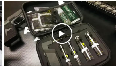
The Full Kit

This reviewer breaks down the entire Blazntech package.