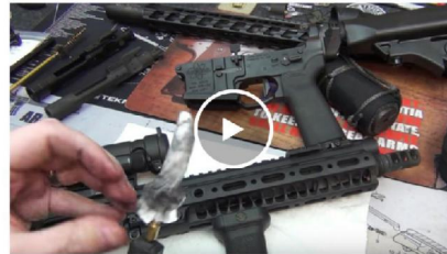
Blazntech Cleaning an AR-15