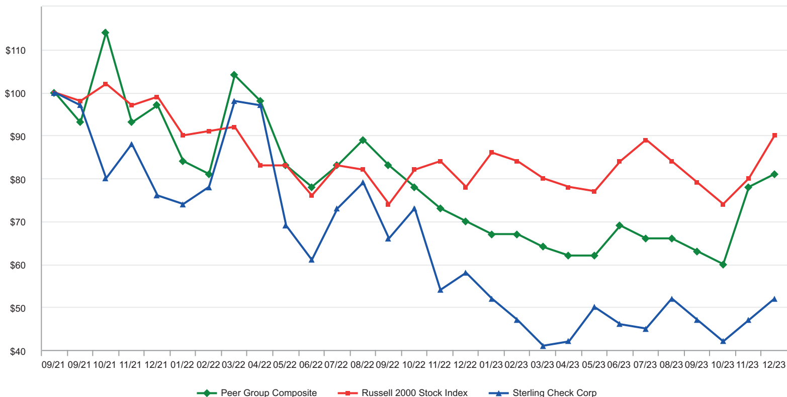
Comparison of Cumulative Total Return Among Sterling Check Corp., the Russell 2000 Index and a Peer Group(1)

(1) The performance graph and related information shall not be deemed “soliciting material” or to be “filed” with the SEC, nor shall such information be incorporated by reference into any future filing under the Securities Act or the Exchange Act, whether made before or after the date hereof and irrespective of any general incorporation language in any such filing, or otherwise subject to the liabilities under the Securities Act or Exchange Act, except to the extent that we specifically incorporate it by reference into such filing.