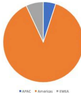
Geographical Breakdown of Employees