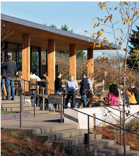
Exterior view of Archery Summit's new tasting room.

gross profit by 3% through the execution of our operational strategy, including a better portfolio mix, balanced inventory, and tactical price increases. Despite softer revenue, we maintained a healthy balance sheet, generated strong returns on our assets, and rebuilt inventory levels due to the short supply in 2020 and 2021, all while reducing our leverage. We also executed our planned capital projects, supporting our long-term growth strategy. Specifically, we invested in water-resiliency and fire mitigation projects, replanted high-value vineyards to bolster future crop yields, and renovated and expanded tasting rooms at Archery Summit