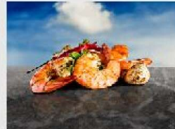
Fresh, Never Frozen Shrimp

Also to date, the company has raised $945,000 in a Series A Priced Round and is seeking additional funds for further development. Active2Tec is ready to purchase RC shrimp for international export.