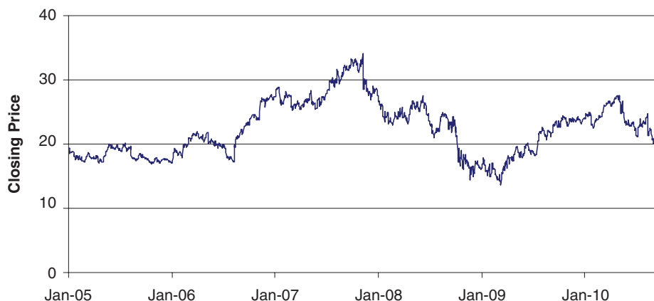
Historical Performance of the Common Stock of Cisco Systems, Inc.

The graph below illustrates the performance of Cisco Systems, Inc.'s common stock from January 1, 2005 through September 29, 2010, based on information from Bloomberg, and we have not participated in the preparation of, or verified, such information. Past performance of the Underlying Stock is not indicative of the future performance of the Underlying Stock.