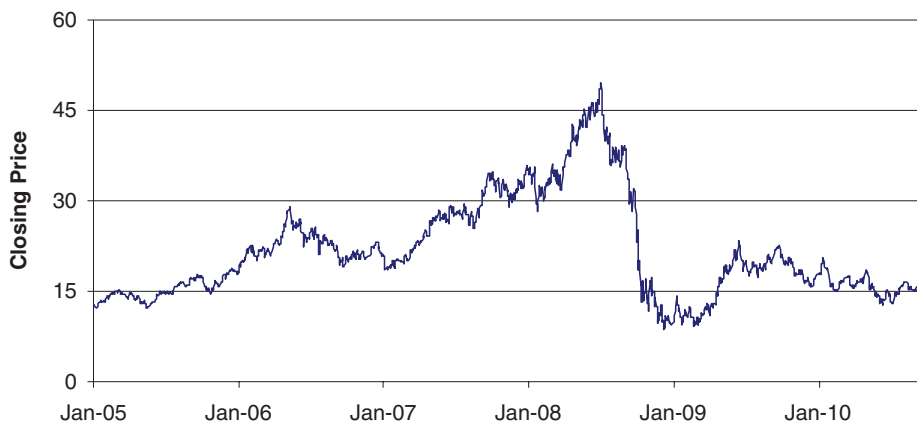
Historical Performance of the Common Stock of Weatherford International Ltd.

The graph below illustrates the performance of Weatherford International Ltd.'s common stock from January 1, 2005 through September 29, 2010, based on information from Bloomberg, and we have not participated in the preparation of, or verified, such information. Past performance of the Underlying Stock is not indicative of the future performance of the Underlying Stock.