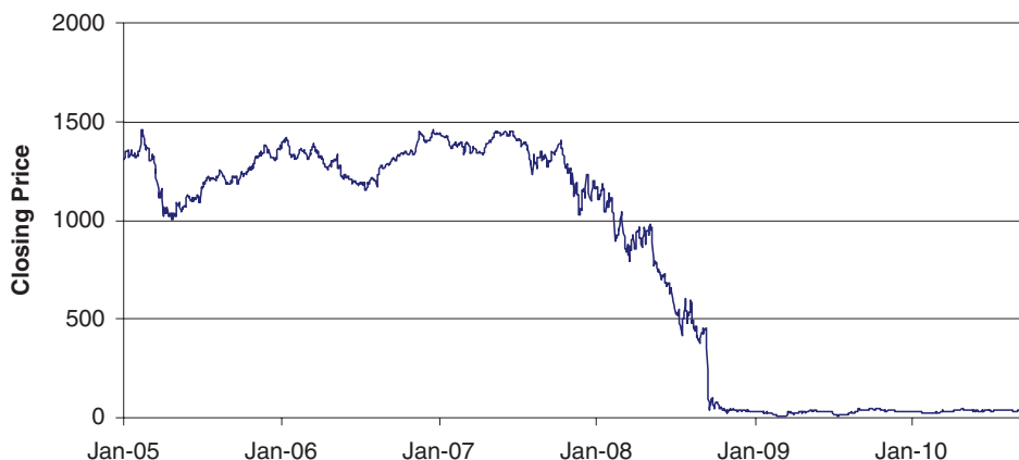
Historical Performance of the Common Stock of American International Group, Inc.

The graph below illustrates the performance of American International Group, Inc.'s common stock from January 1, 2005 through September 29, 2010, based on information from Bloomberg, and we have not participated in the preparation of, or verified, such information. Past performance of the Underlying Stock is not indicative of the future performance of the Underlying Stock.