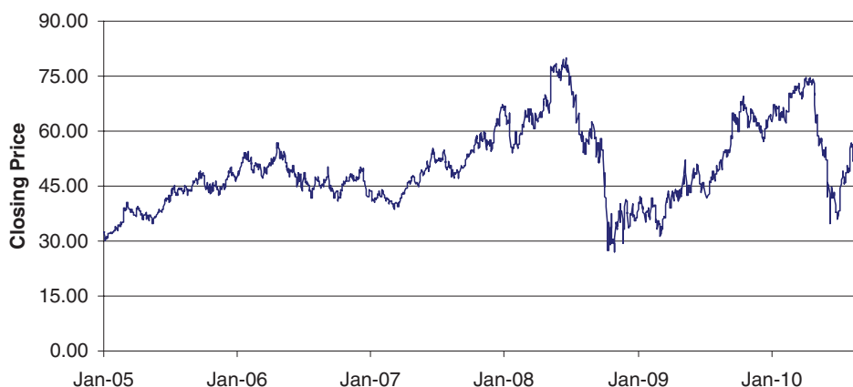
Historical Performance of the Common Stock of Anadarko Petroleum Corporation

The graph below illustrates the performance of Anadarko Petroleum Corporation's common stock from January 1, 2005 through September 10, 2010, based on information from Bloomberg, and we have not participated in the preparation of, or verified, such information. Past performance of the Underlying Stock is not indicative of the future performance of the Underlying Stock.