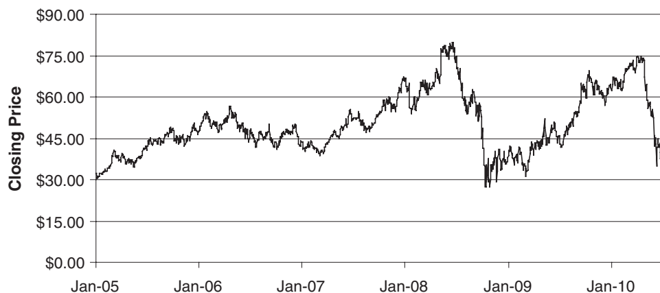
Historical Performance of the Common Stock of Anadarko Petroleum Corporation

The graph below illustrates the performance of Anadarko Petroleum Corporation's common stock from January 1, 2005 through July 16, 2010, based on information from Bloomberg, and we have not participated in the preparation of, or verified, such information. Past performance of the Reference Underlying is not indicative of the future performance of the Reference Underlying.