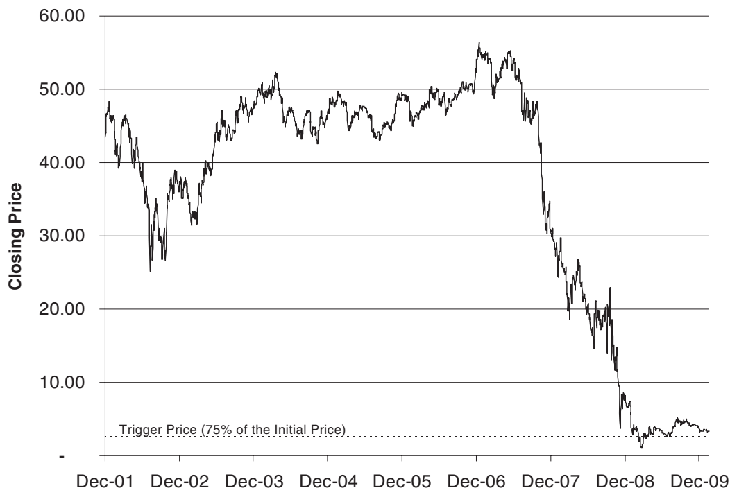
Historical Performance of the Common Stock of Citigroup Inc.

The graph below illustrates the performance of Citigroup's common stock from December 15, 2001 through February 1, 2010, based on information from Bloomberg, and we have not participated in the preparation of, or verified, such information. Past performance of the Reference Underlying is not indicative of the future performance of the Reference Underlying.