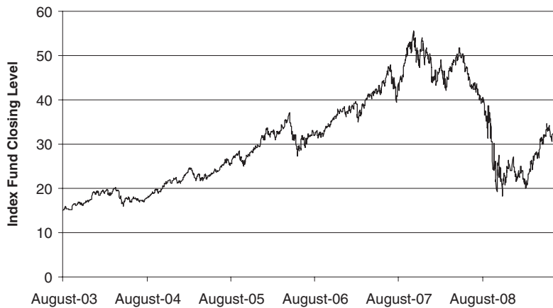
Historical Performance of the iShares® MSCI Emerging Markets Index Fund