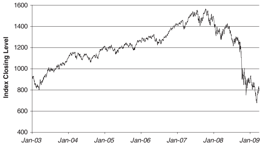
Historical Performance of the S&P 500® Index