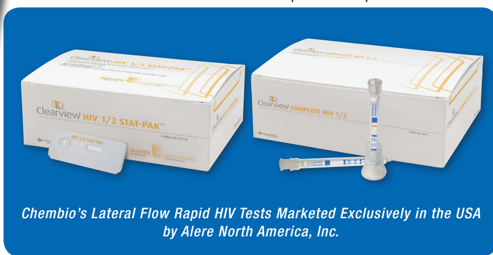
Chembio's Lateral Flow Rapid HIV Tests Marketed Exclusively in the USA by Alere North America, Inc.