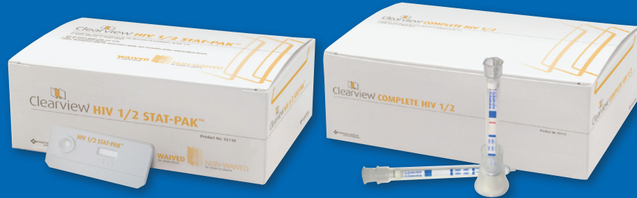
Chembio's Lateral Flow Rapid HIV Tests Marketed Exclusively in the USA by Alere North America, Inc.