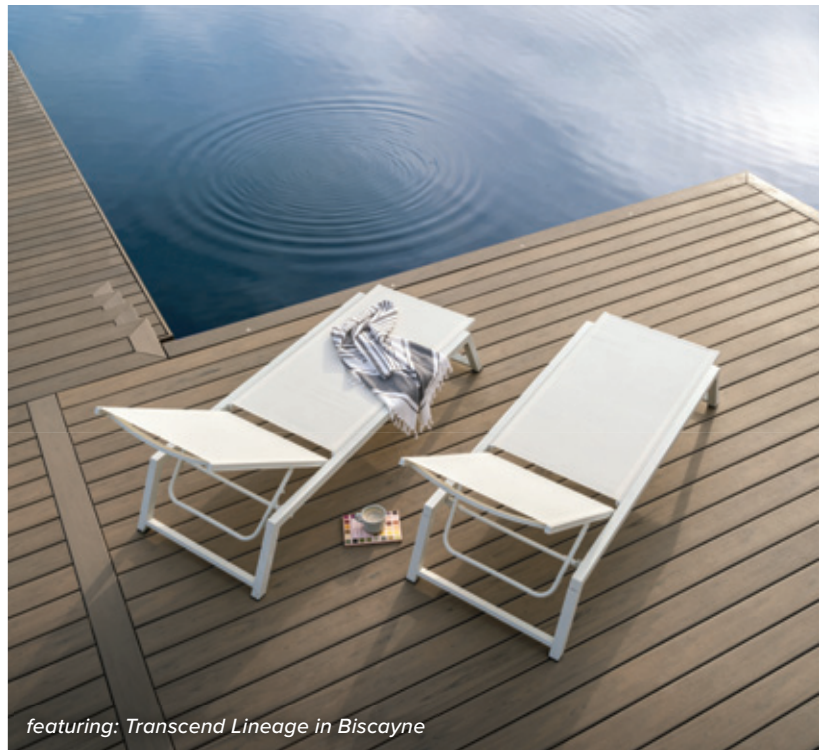
featuring: Transcend Lineage in Biscayne