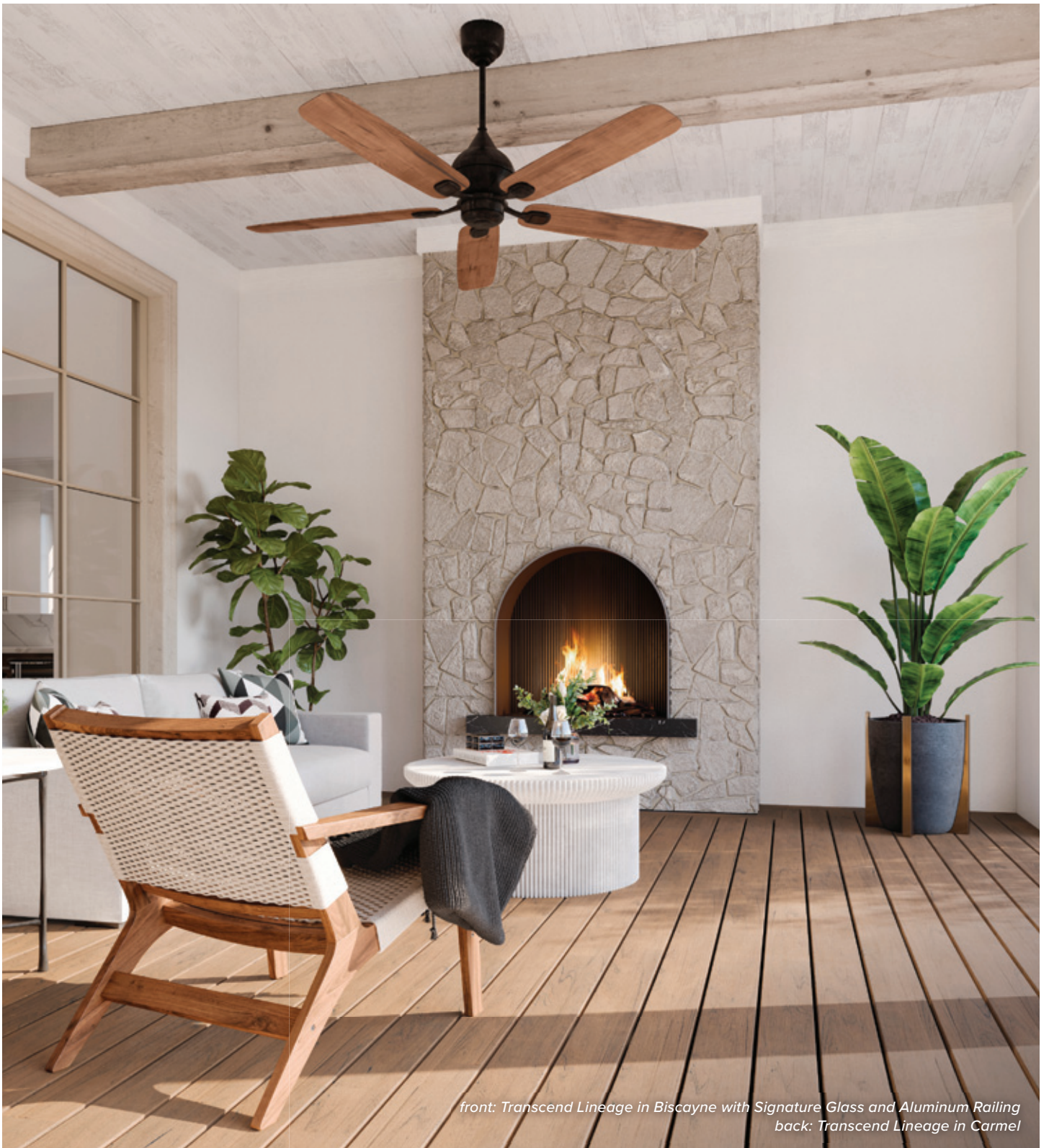
front: Transcend Lineage in Biscayne with Signature Glass and Aluminum Railing back: Transcend Lineage in Carmel