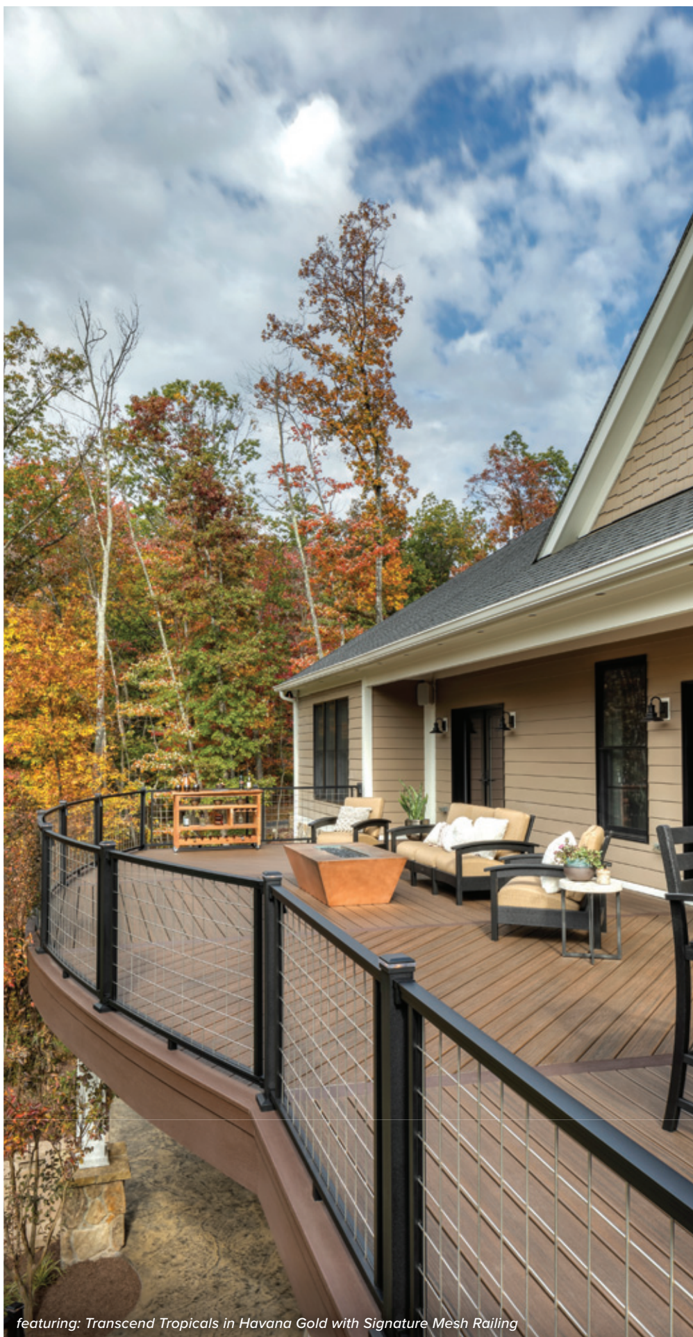
featuring: Transcend Tropicals in Havana Gold with Signature Mesh Railing