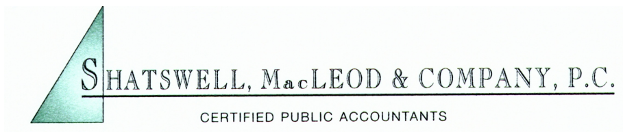
Exhibit 23.1 SALISBURY BANCORP, INC. CONSENT OF SHATSWELL, MACLEOD & COMPANY, P.C.