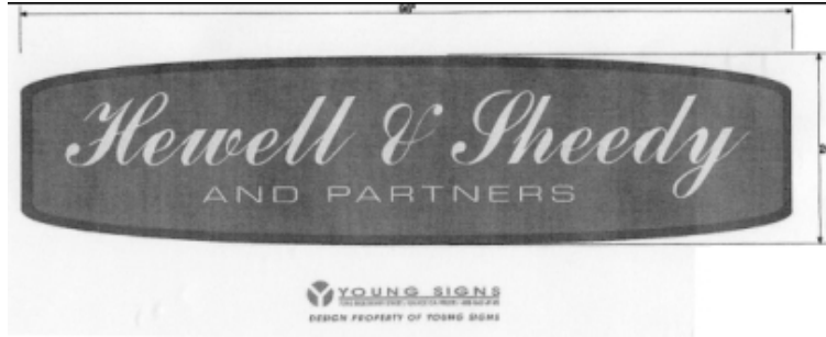
Exhibit D Tenant's Signage