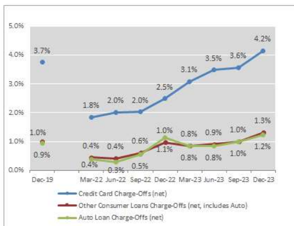
Figure 6: This represents $2.1 trillion in bank-held consumer loans. While not directly comparable to Recreation and Home Improvement loans, the trends are very similar to those in MFIN’s portfolio. While FICOs are not disclosed by the FDIC, historically, commercial banks have had the most stringent underwriting standards with little sub-prime exposure.