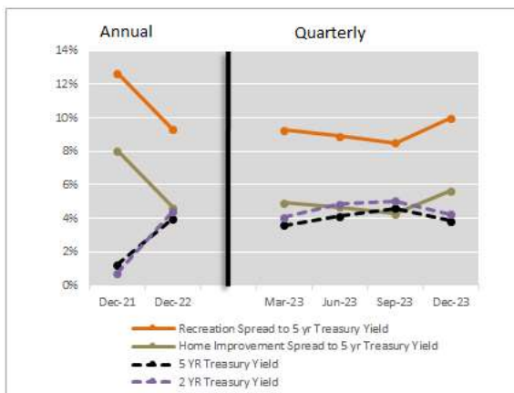
Yield-Spread of Recreation and Home Improvement loans (relative to the risk-free rate)

Figure 5: MFIN stated that the weighted average life of its loans was ~ 3 years, so its loan yields should be compared to the 3YR treasury rate. The 3YR treasury yield increased 304bps in 2 years while MFIN’s blended yields only increased 50bps in the same period (at 4Q23 over 4Q21). MFIN is getting paid less for the risk it is taking which is clear in lowered ROA and ROE.