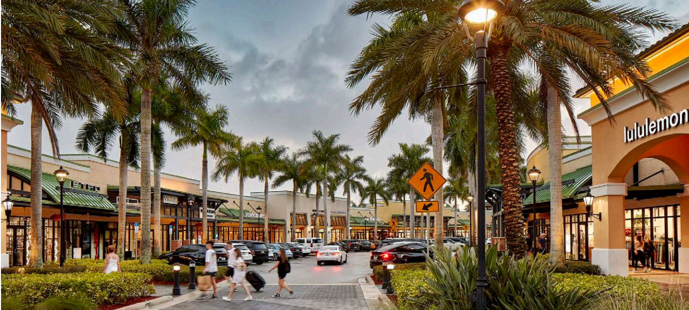
Sawgrass Mills, Sunrise, FL

“Consistent outperformance in cash flow growth, value creation and returns to shareholders, have been, and we expect will continue to be, hallmarks of Simon.”