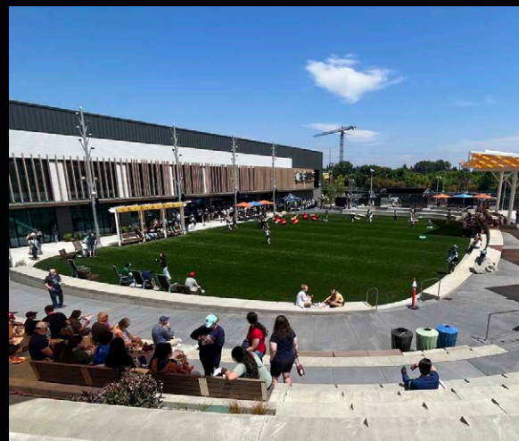
Northgate Station, Seattle, WA