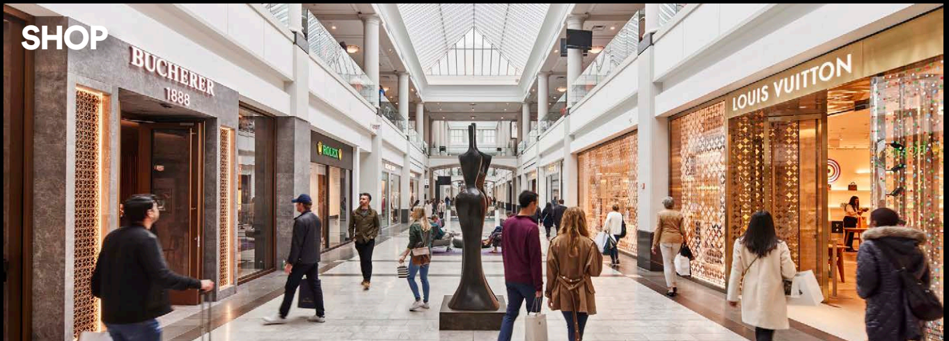
Sawgrass Mills, Sunrise, FL