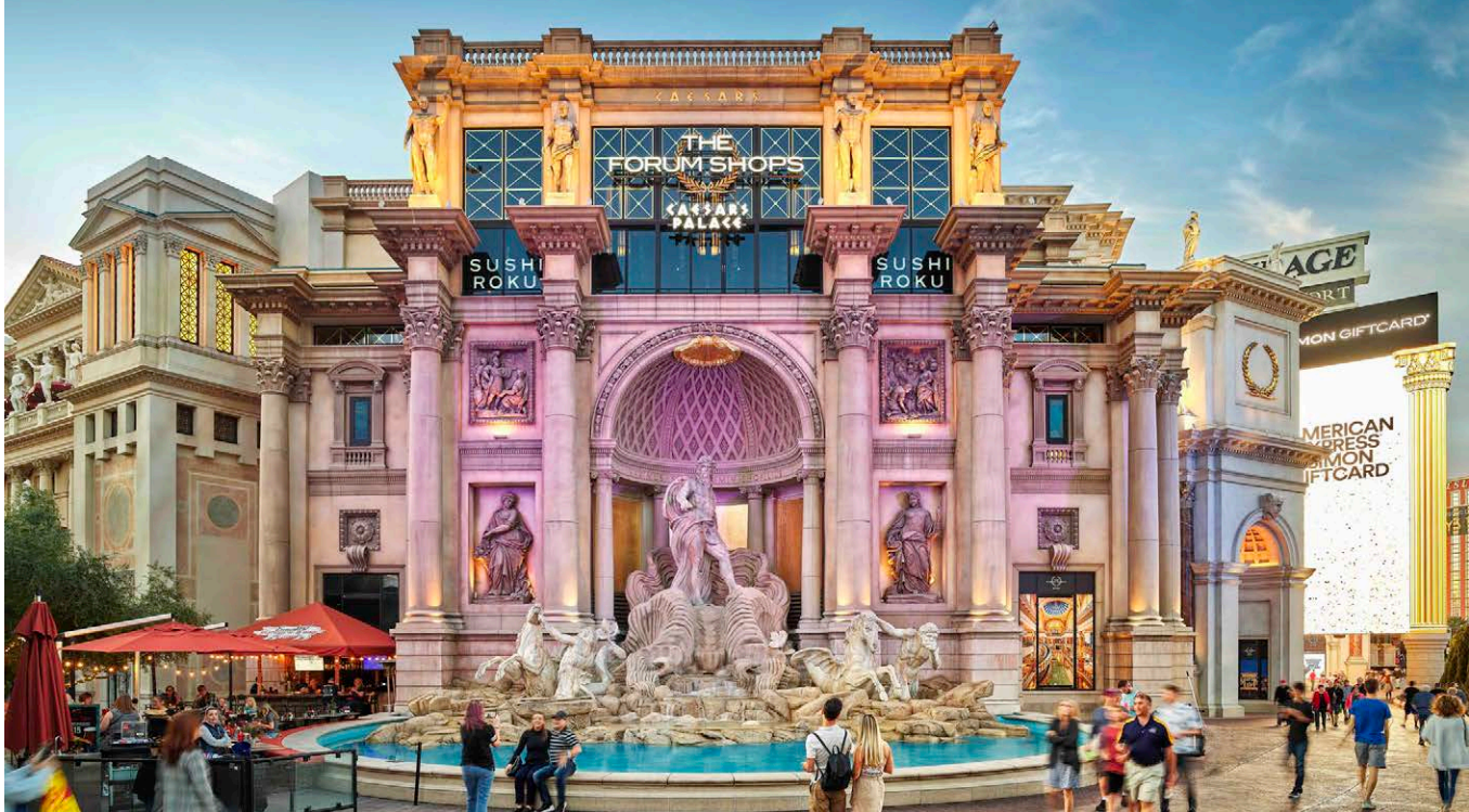
The Forum Shops at Caesars Palace, Las Vegas, NV

When you consistently grow over multiple decades, no matter the economic cycles or competition you face, you develop an understanding of your strengths and who you are. This understanding, coupled with our conviction, will fuel future growth. We continually set the bar higher as property owners and stewards of capital. This is not new, and after 30 years, it's fun to look back, at least momentarily; but more importantly, we are positioned to make our future even more prosperous.