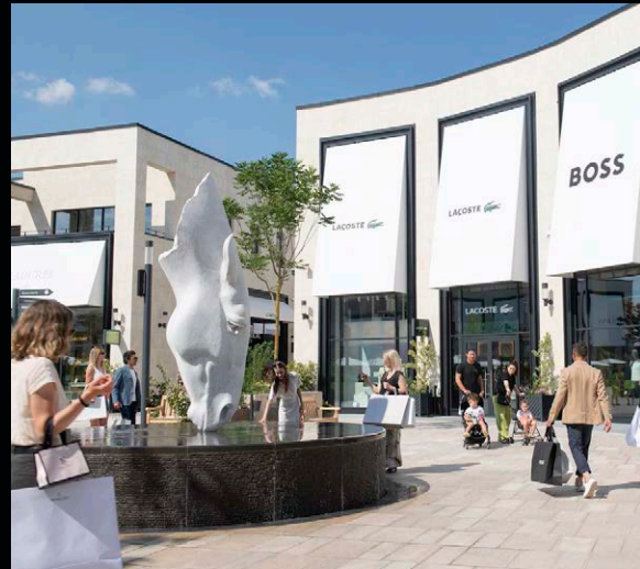
Paris-Giverny Designer Outlet, Vernon, France