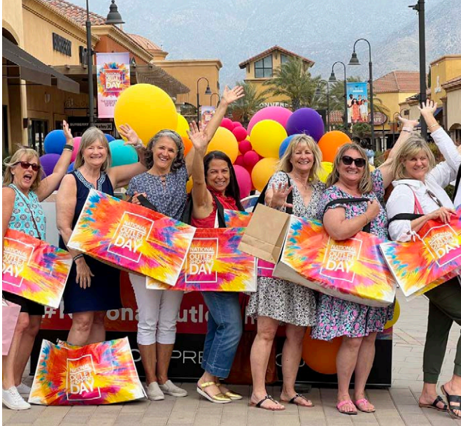
National Outlet Shopping Day