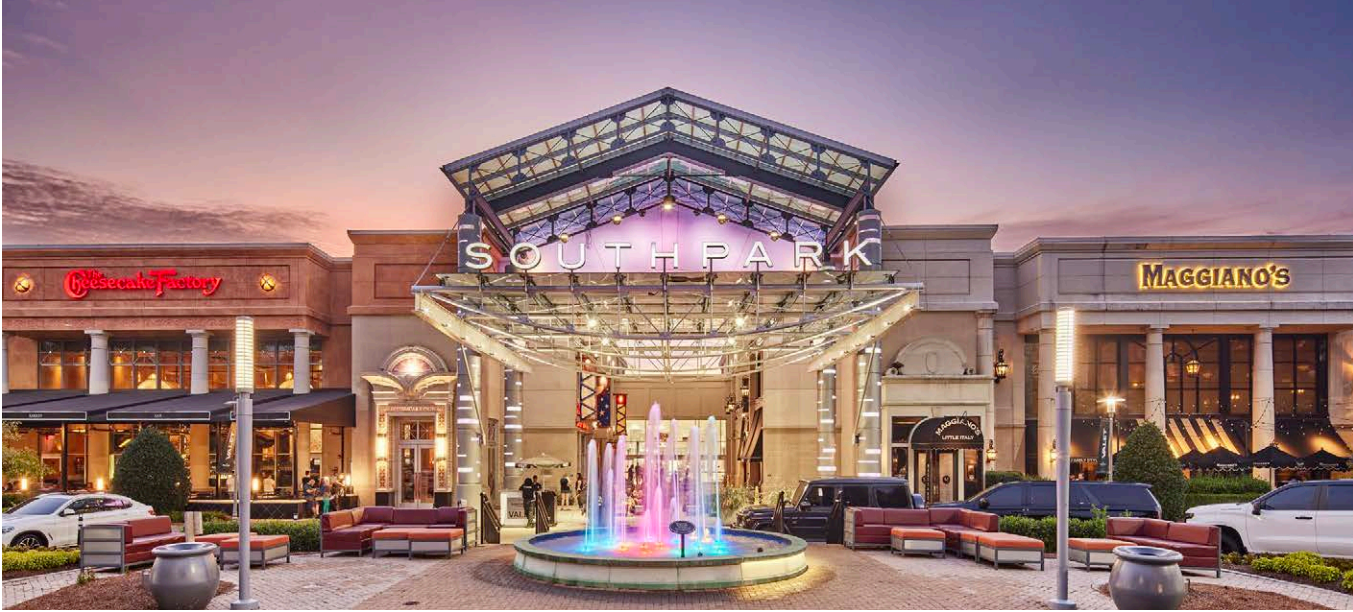
SouthPark, Charlotte, NC