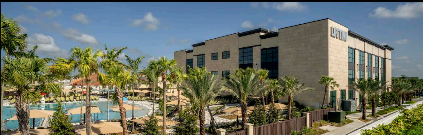
The Falls, Miami, FL