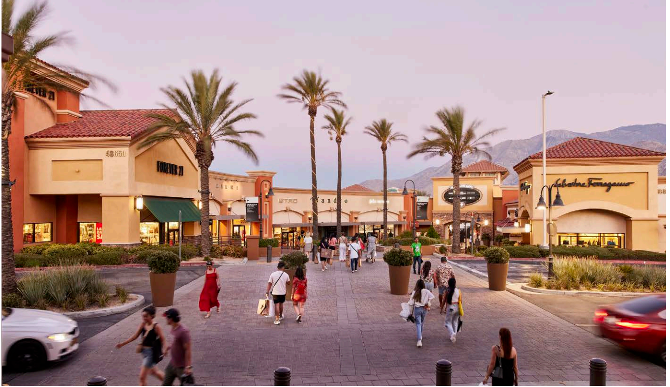
Desert Hills Premium Outlets, Cabazon, CA