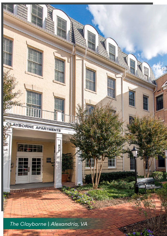
The Clayborne | Alexandria, VA

Our screening model includes factors from four key areas: demographics, local economy, real estate, and operations. Key demographic factors included in our weighing of market opportunities include population growth of our target cohorts by age and income range, net domestic migration, and regional educational attainment – both existing and projected increases. When evaluating local economies, we consider gross regional product and labor force growth as well as their volatility. Furthermore, industrial composition, wage growth and household income growth are considered. Real estate factors include historic and projected rents, supply/demand balance and their relative volatility. Additionally, affordability pressures on our target rents and affordability gaps between asset classes are analyzed. Operational factors such as climate risk and associated insurance rate growth, jurisdictional regulatory environment, and synergies with existing markets are also included. Together, these factors provide Elme with a comprehensive view of the strengths and weaknesses of markets and their potential to match our strategic market allocation objectives.