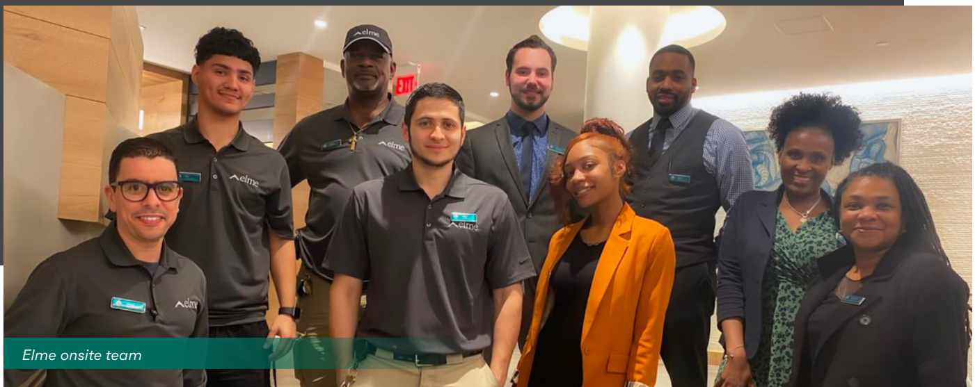
Elme onsite team

Bringing our community-level operations in-house was motivated by a vision for improved performance and dedication to providing unmatched value to our stakeholders. In today’s dynamic real estate environment, the pace of innovation and adaptation has accelerated, requiring a proactive and aligned approach to community management. By streamlining internal processes and adopting new technologies with a resident-centric approach, we have implemented significant changes that underscore our commitment to delivering long-term value to our shareholders.