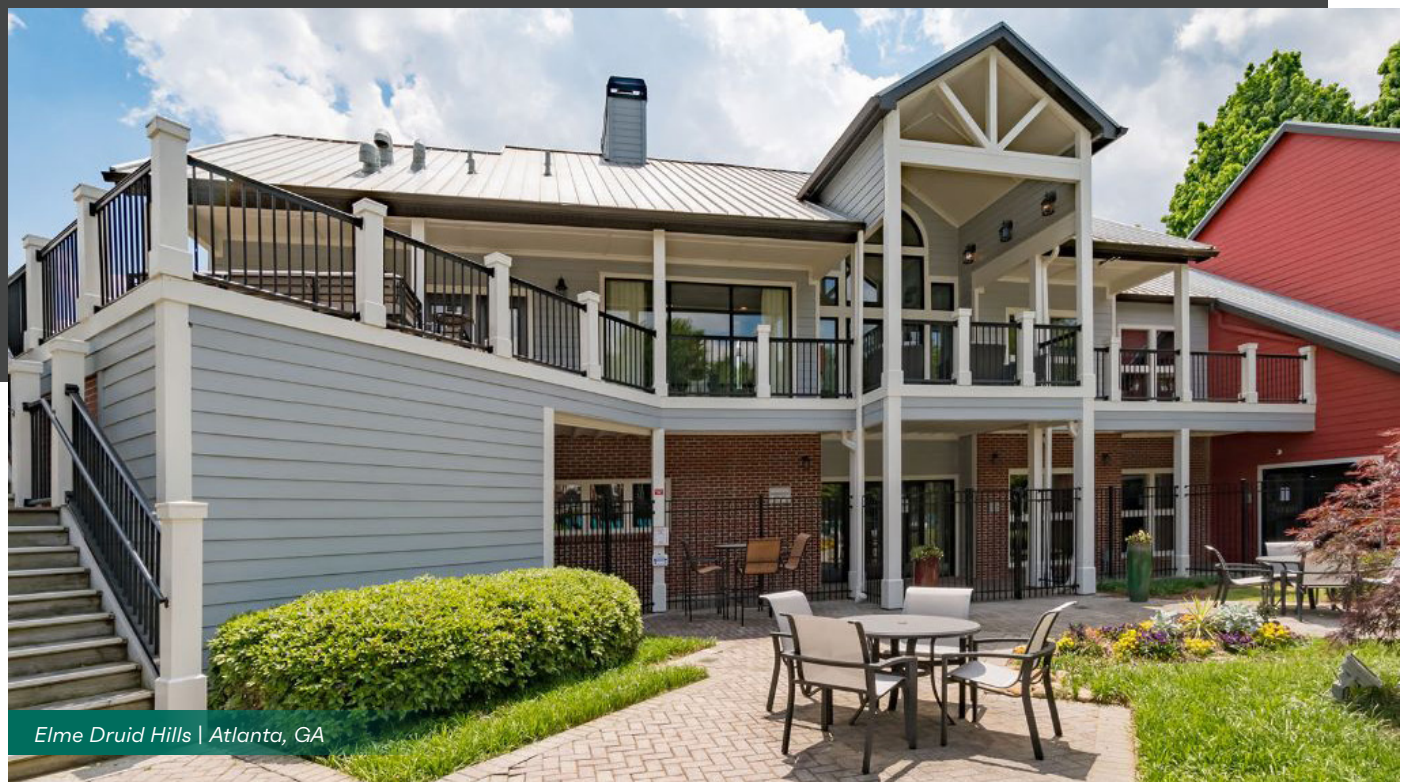
Elme Druid Hills | Atlanta, GA

A rare find in a mature, affluent inside-the-perimeter location, Elme Druid Hills is situated on an expansive 50 acres, or 10 homes per acre, offering longer-term redevelopment options. The community directly aligns with our Class B value-add strategy and offers renovation potential on all 500 homes. Druid Hills is an affluent area with a growing job base, providing seamless accessibility to over 400,000 jobs within a