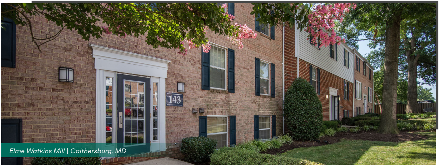
Elme Watkins Mill | Gaithersburg, MD

Looking forward, we are enthusiastic about the improvements that we are making and opportunities still ahead as we implement operational enhancements and utilize our new technology to enhance profitability, which we believe will lay the groundwork for above-market performance over the next several years.