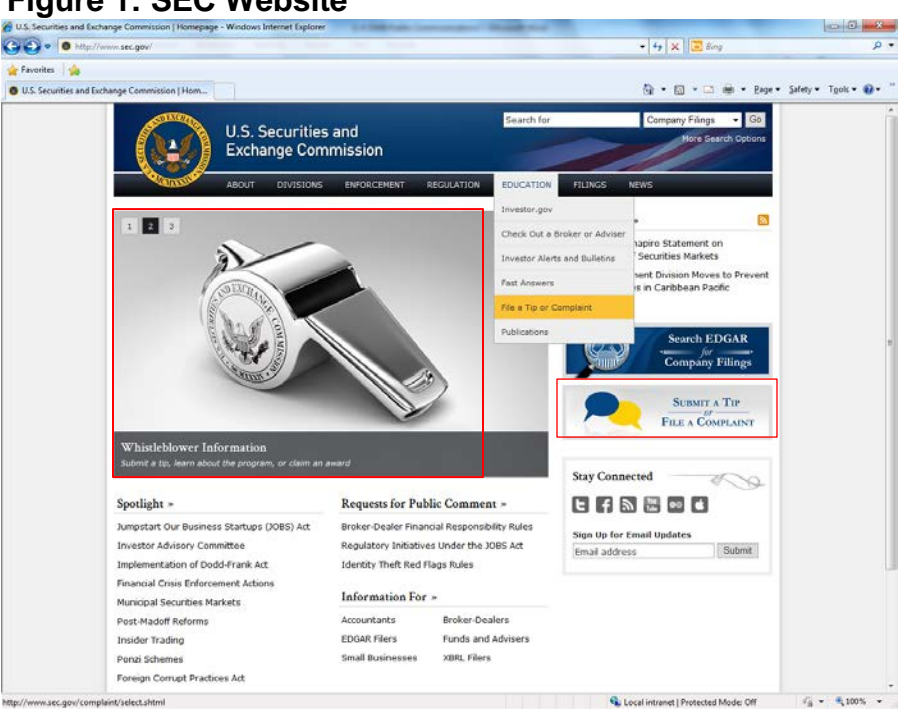
Figure 1: SEC Website

There are four or more possible ways the public can access OWB's website to learn about the whistleblower program or file a complaint with the SEC. The SEC's public website consists of two hyperlinks: (1) Submit a Tip File a Complaint, and (2) Large "whistle" image, as shown in Figure 1, that takes the public to OWB's website. The third way to reach OWB's website from the SEC's homepage is by using the search engine on the SEC's public website. OIG's use of the keyword "whistleblower" and the option "SEC Documents" in the search engine resulted in 397 options, the first of which led us to OWB's website. Finally, from the SEC's public website, the "Education" drop down menu has a "File a Tip or Complaint," option that takes the public to OWB's website. Overall, we found the quickest way to access OWB's website is by clicking on the "Whistle" hyperlink.